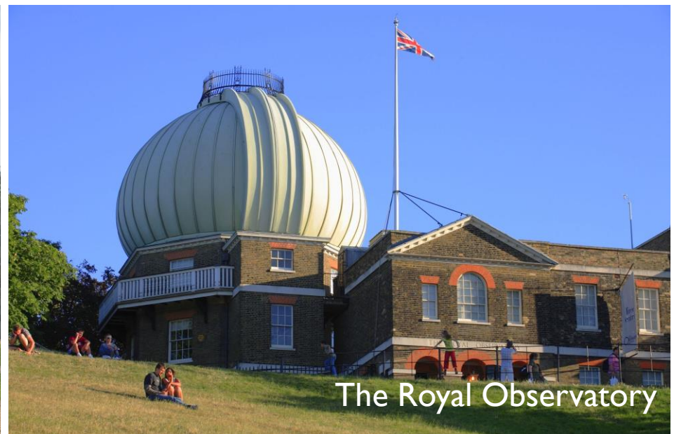
The Royal Observatory