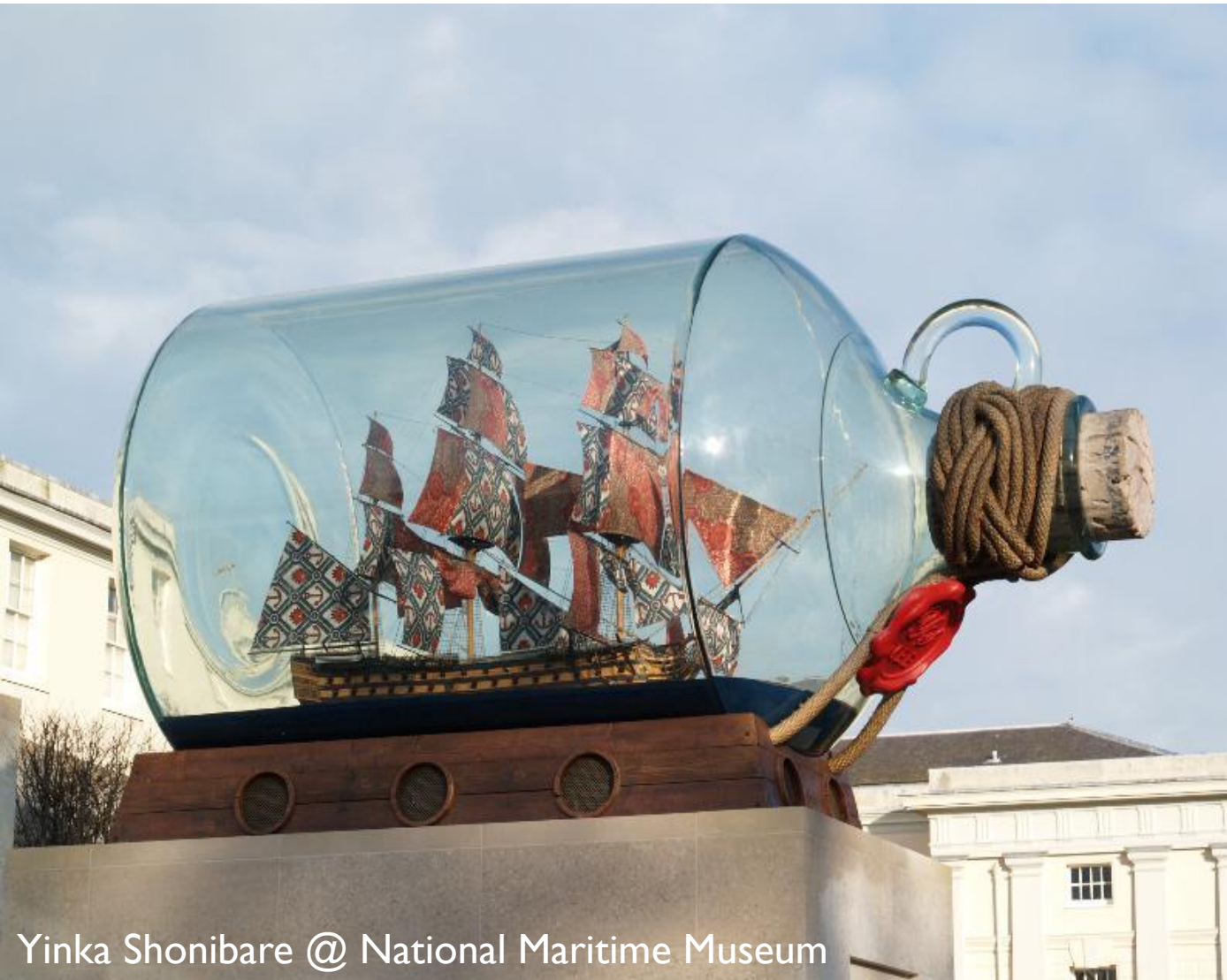
Yinka Shonibare @ National Maritime Museum

Build our collective power: council, creative organisations, businesses, volunteers, residents