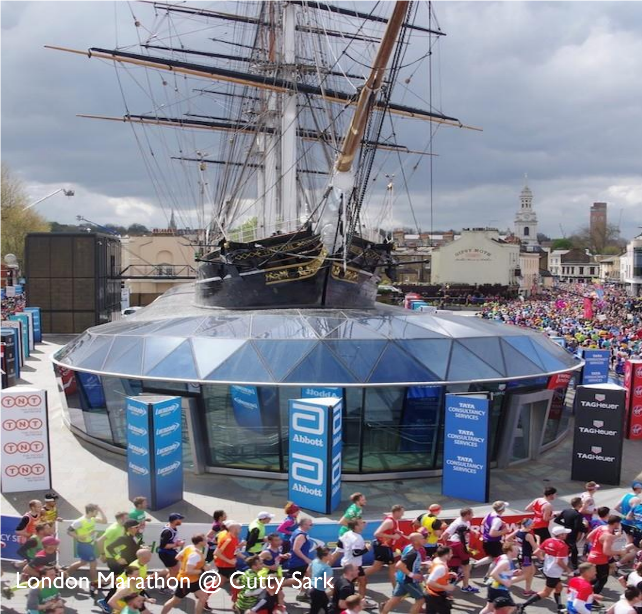
London Marathon @ Cutty Sark