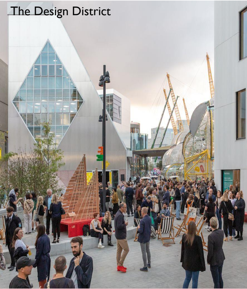
The Design District