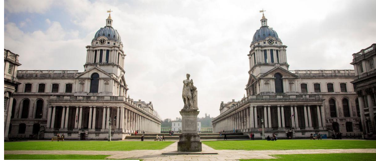
University of Greenwich