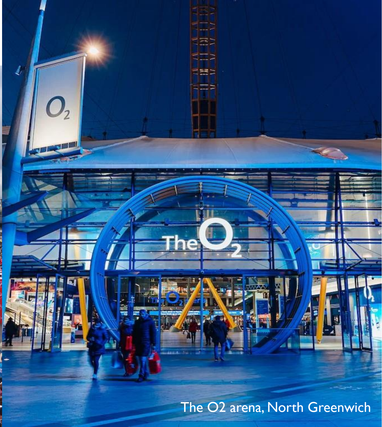
The O2 arena, North Greenwich