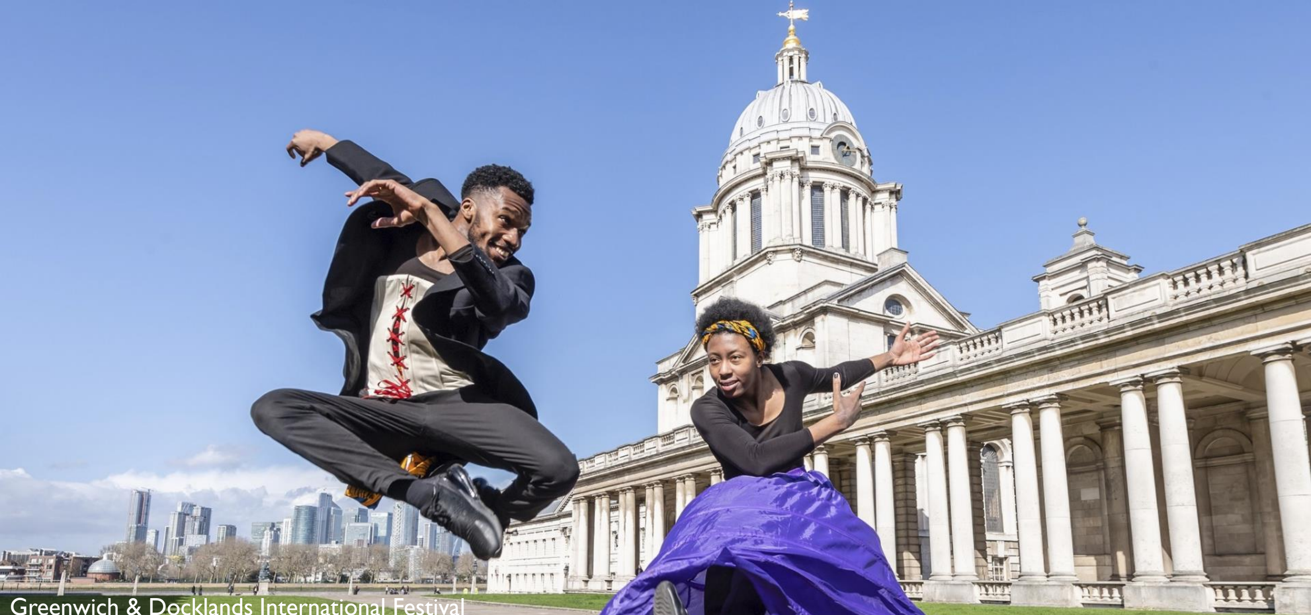
Greenwich & Docklands International Festival