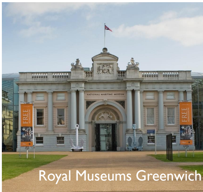
Royal Museums Greenwich